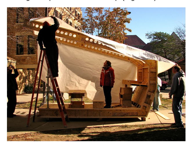
Figure 3. Full Scale Singe Bay Mock-up

intervals. Designed to work with both centralized and linear site conditions, the notion of service hubs were maintained and accentuated as nodes within smaller neighborhoods or enclaves. These three to five unit enclaves (blocks) were set-up to promote small community interaction for play areas and for community dining. The resultant clusters were oriented to take advantage of the sun and to create a hierarchy of front, back and side yards/spaces, which were intended to minimize the feeling of repetition in the camp (Figure 5).