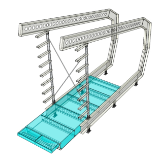
Figure 4. C - Section with Drawer/Floor

The C-Section structural bent allows for the quick set-up of the structural frame. This assembly derives from separate components that pack tightly for transport, and with the use of common tools can be quickly bolted together. The C-Section also allows for a clear definition of front and back, where the taller front becomes the solar-oriented interface with the other units and the rear of the unit becoming a privileged private area that serves as the designated sleeping area (Figure 3). The C-Shape was chosen to due to its ability to quickly shed water and based on historical research that indicated that some of the earliest human shelters were openmouthed caves with large overhangs - the studio appropriated this proto-version of the C-Shape as a meaningful precedent. Fabrication methods were discussed for the C- Section that would utilize CNC technology and designs were prepared based on the limits of this technology. Digitally conceived the C-Sections were ultimately made by hand.