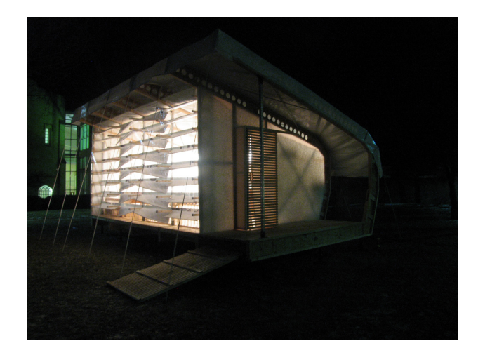
Figure 1. 3<sup>rd</sup> Year "Hands-On" Fabrication Studio Emergency Shelter Prototype – "Night"

food with debit cards, etc. These questions and their counterparts in the design process itself, such as the purity of Digital vs. Analog design approaches, or perhaps the truth that design has always has been a Hybrid<sup>1</sup> of the various modes used to develop it; formed the basis for the studio itself.